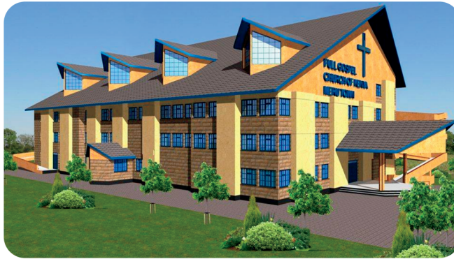
PROPOSED MEGA SANCTURARY